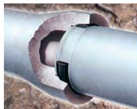
Triple lip seal

VIP-POLYMERS LTD 15 Windover Road, HUNTINGDON PE29 7EB, UK