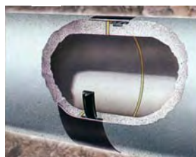
Double fin jacking seal