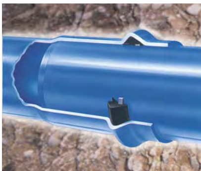
Pressure pipe for potable water

We make seals to customers' specific requirements including locked-in seals incorporating our proprietary Viploc™ design. This features a locking ring which holds the seal in a groove within the pipe.